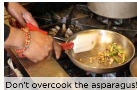
Don’t overcook the asparagus!