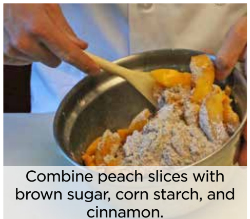
Combine peach slices with brown sugar, corn starch, and cinnamon.