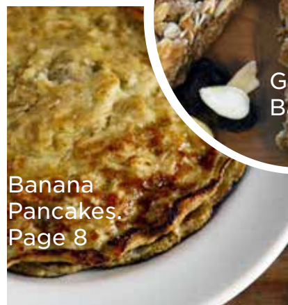
Banana Pancakes. Page 8