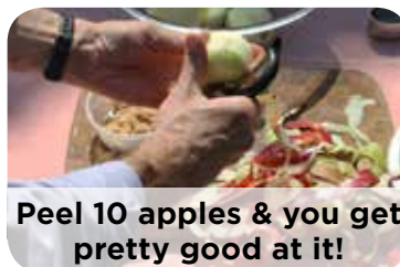
Peel 10 apples & you get pretty good at it!