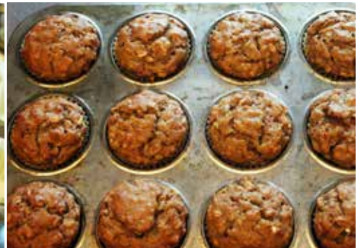
Ready to serve!