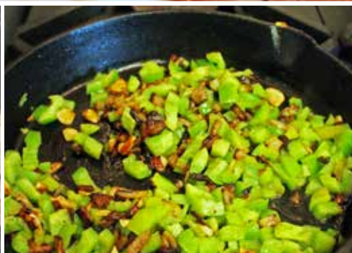
Peppers go in when garlic is toasted.