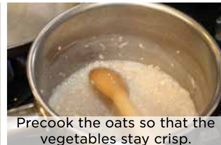
Precook the oats so that the vegetables stay crisp.