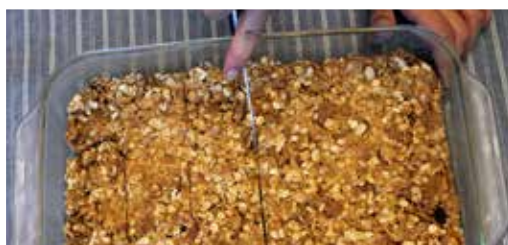
After refrigerated, cut into bars.