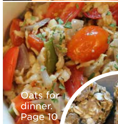
Oats for dinner. Page 10