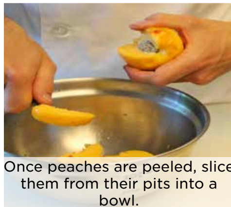
Once peaches are peeled, slice them from their pits into a bowl.