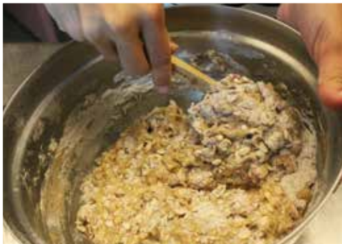
Don't overmix! You want some lumps.