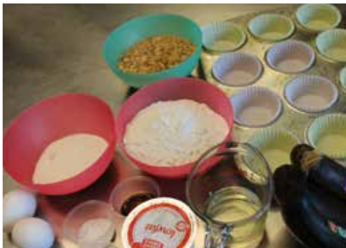
A great way to use overripe bananas!