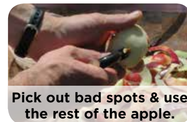
Pick out bad spots & use the rest of the apple.