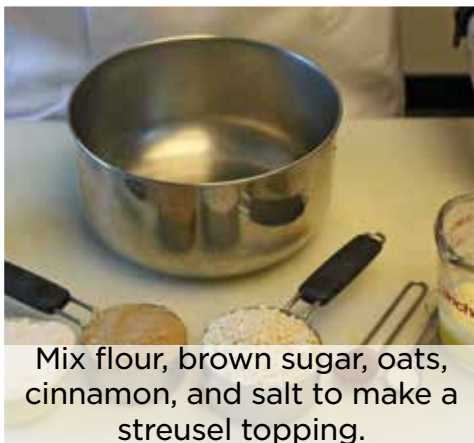
Mix flour, brown sugar, oats, cinnamon, and salt to make a streusel topping.