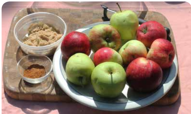
An apple pie doesn't take much to make!

Apple pie is a sweet & satisfying way to enjoy one of autumn's tastiest fruits!