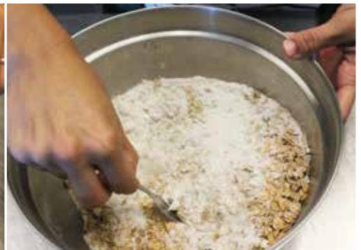
Stir dry ingredients together.