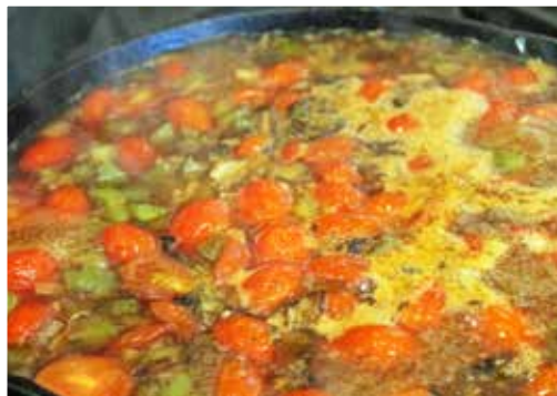
Add water, bring to boil.