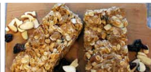
Enjoy these delicious treats!