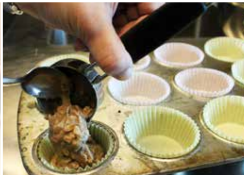
Fill muffin cups with 1/3 cup batter