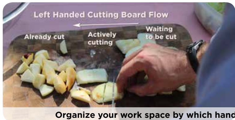
Organize your work space by which hand you use to make cutting quicker and easier!