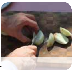
Cutting around the core is the easiest way to get the apples ready to cook.