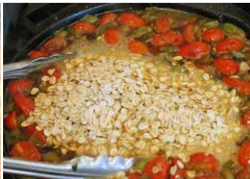
Stir in oats.