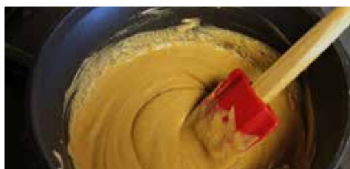
Melt peanut butter and honey on stove.