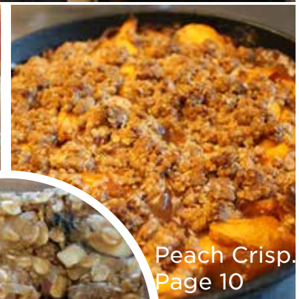
Peach Crisp. Page 10