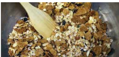
Mix all dry ingredients in a large bowl.