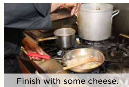
Finish with some cheese.