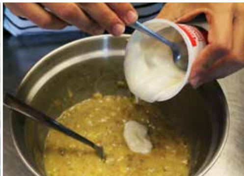
Mix bananas with yogurt, eggs, oil.