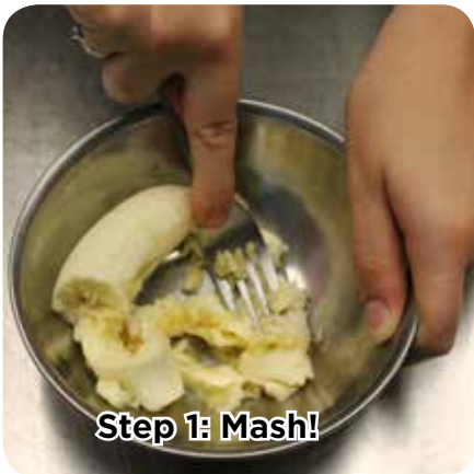
Step 1: Mash!