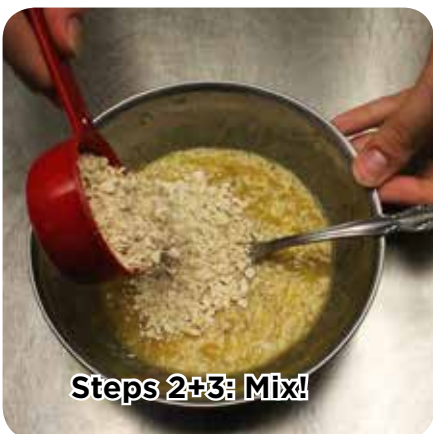
Steps 2+3: Mix!