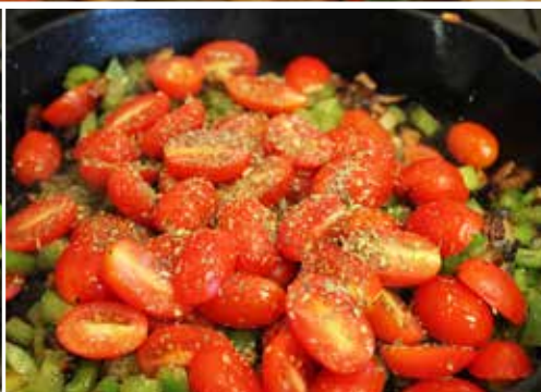
Add tomatoes and herbs!