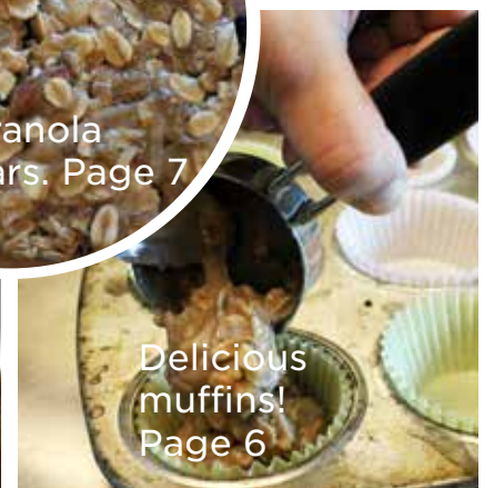
Delicious muffins! Page 6