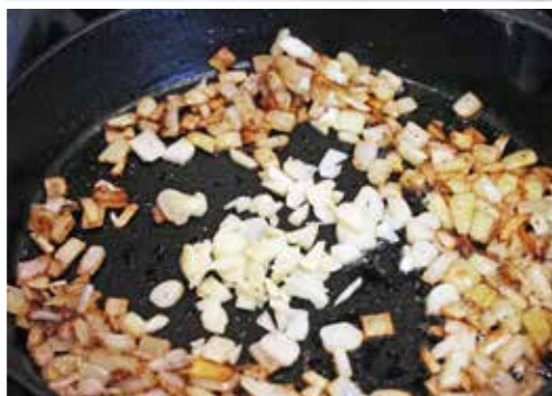
Add garlic when onions are brown.