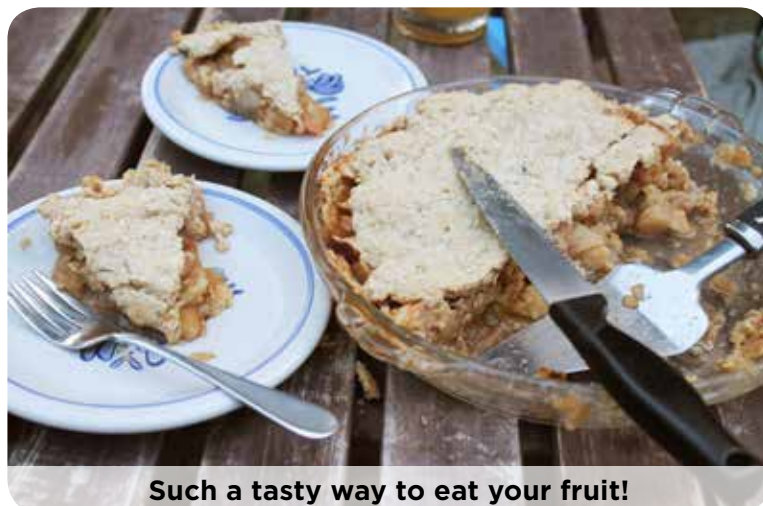
Such a tasty way to eat your fruit!