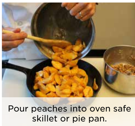
Pour peaches into oven safe skillet or pie pan.