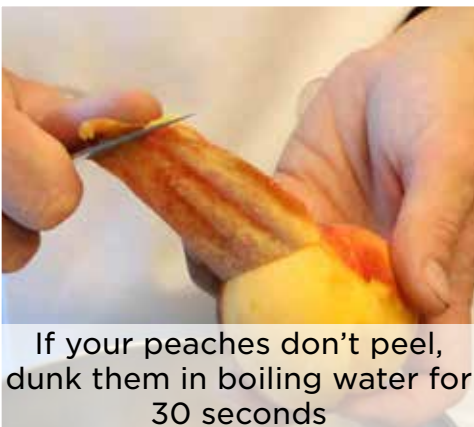
If your peaches don't peel, dunk them in boiling water for 30 seconds