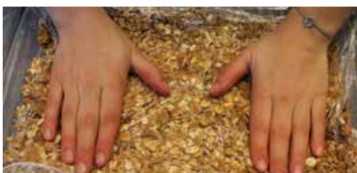
Add mixture to pan and flatten with hands.