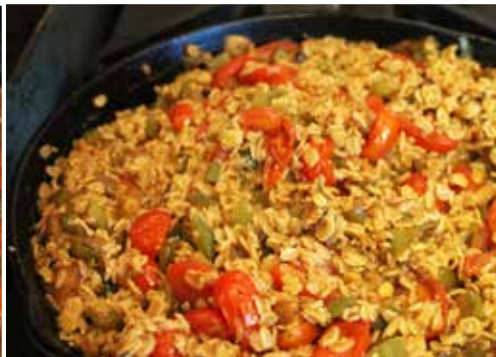
Ready to serve!