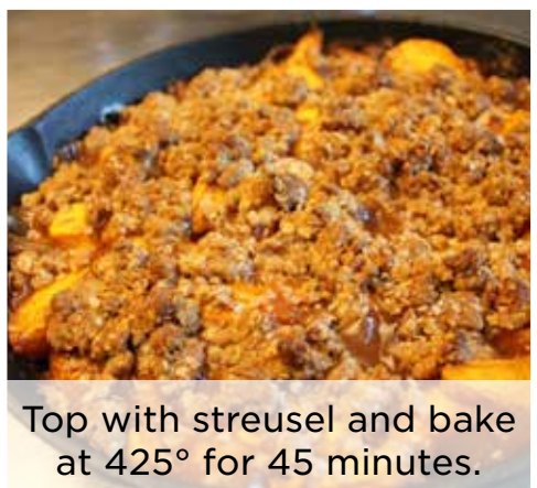
Top with streusel and bake at 425° for 45 minutes.