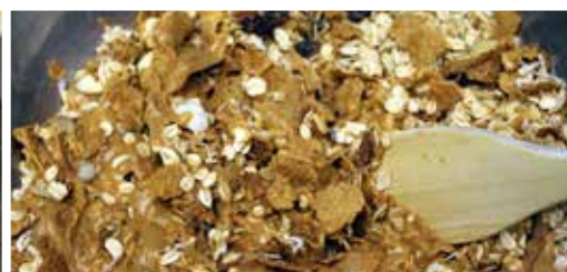
Add peanut butter to dry ingredients and mix.